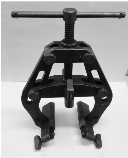
Popular: The WT28, 2" through 8"

Due to its unique design the WT Clamp ensures that the clamping forces are evenly spread round the pipe because the distance between the clamping points are exactly the same. The arms are made of cast aluminium which allows a clamping force to meet the requirements for all pipe dimensions and wall thicknesses up to 15 mm. The adjusting bolts have stainless steel balls at their ends. This eliminates contact corrosion on stainless steel pipes.