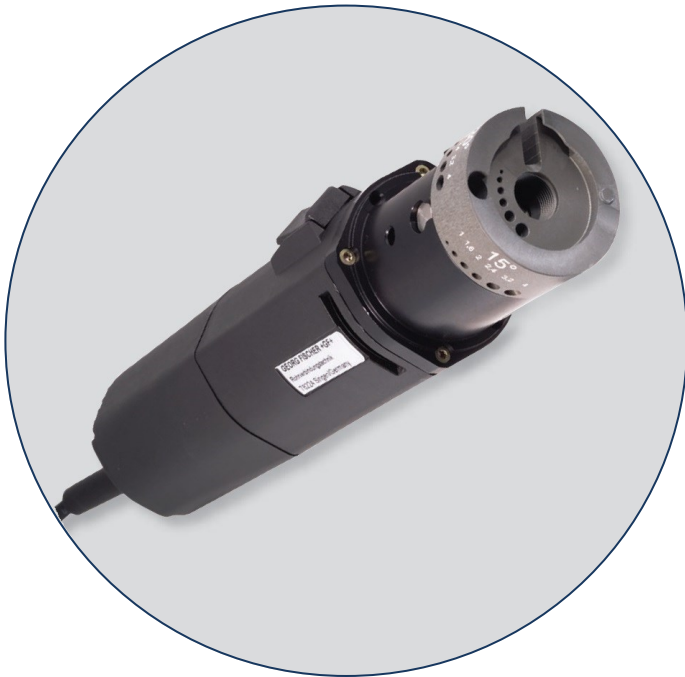
ESG Plus Tungsten Grinder

The best solution for a precise and fast preparation of tungsten electrodes.